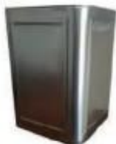
Tin (16L, 18L, 20L)