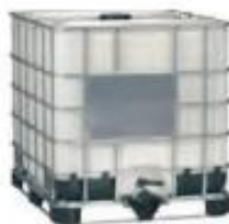
Intermediate Bulk Container (IBC)