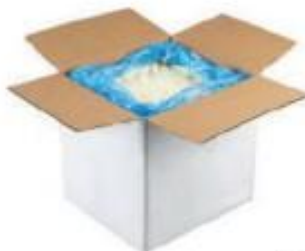
Brown/White Cartons (15, 20, 25Kg)