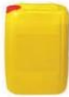
Jerry Cans (3, 5, 10, 20, 25L)