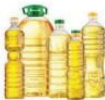
Pet Bottles (1, 2, 3, 5L)

The customer ultimately makes the packing selection, but we are here to help and advise. Among our packing options are: