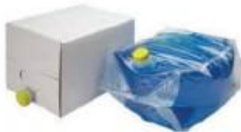
Bag-In-Box (18, 20KG)