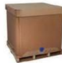
Paper IBC (with heating pad)